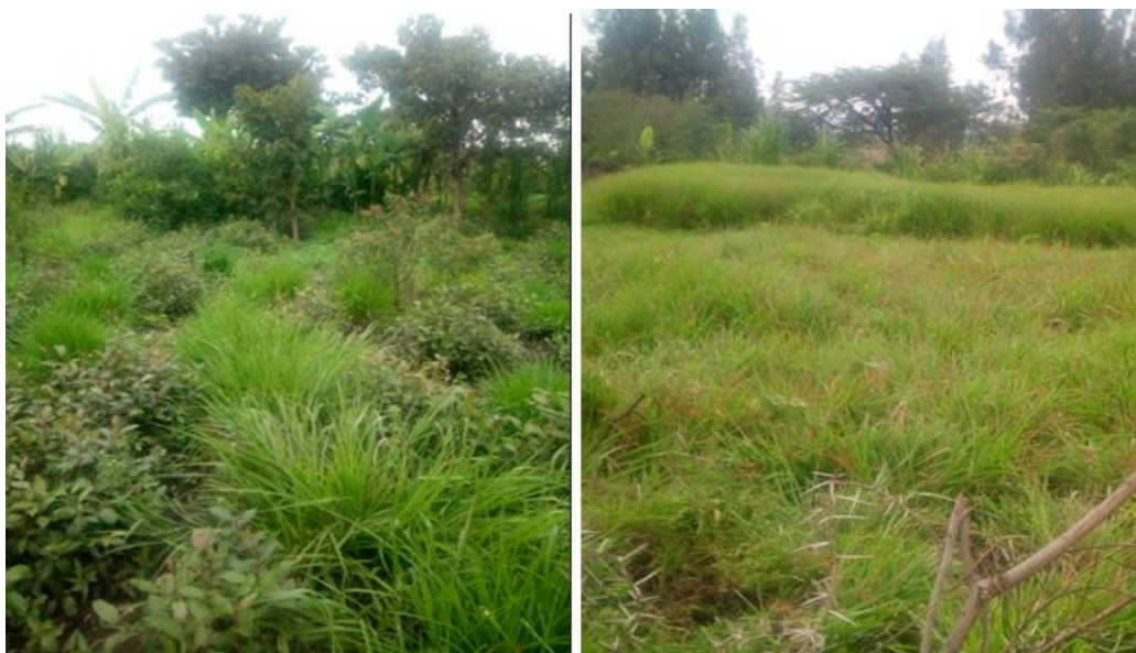
Figure A1. Images of the conventional desho cultivation practices at Hulbareg, Ethiopia: (a) desho grown between rows of perennial crops and timber trees; (b) desho grown in pure stand.

experiment was thus initiated to identify a cropping system that can increase yields of this native grass and simultaneously contribute to reduced input/labor costs linked to the conventional production system of the grass.